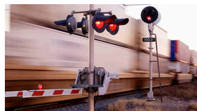
U.S. rail volumes rise 9.5%, Canada's fall during week of work stoppage