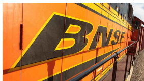
FRA calls for safety culture improvements at BNSF