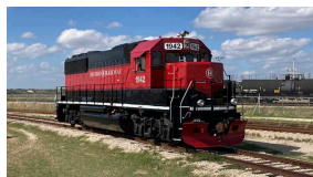
Pinsly Railroad to buy Texas-based Hondo Railway